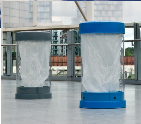
C-Thru™ 190 Recycling Bin