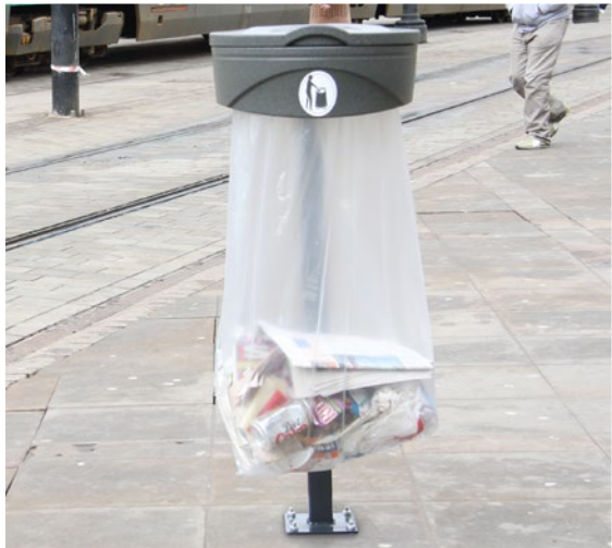
Orbis™ Sack Holder