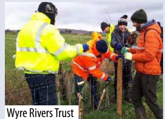
Wyre Rivers Trust