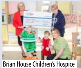
Brian House Children's Hospice