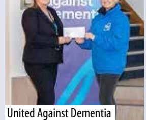
United Against Dementia