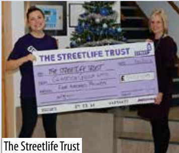
The Streetlife Trust