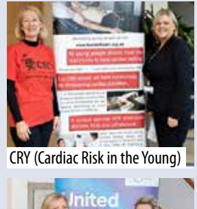
CRY (Cardiac Risk in the Young)