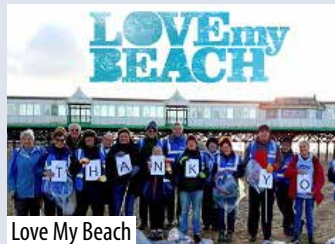
Love My Beach