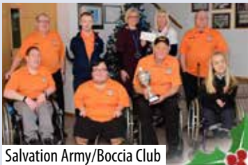
Salvation Army/Boccia Club