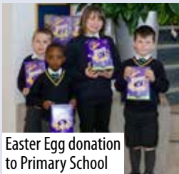
Easter Egg donation to Primary School