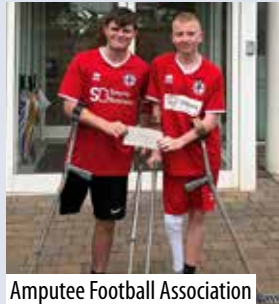
Amputee Football Association