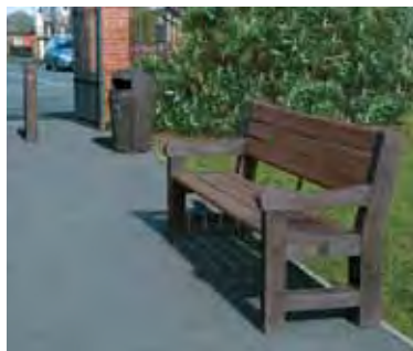
Elwood Seat with co-ordinating Sherwood™ Litter Bin and Glenwood™ Posts.

Many of the Glasdon seats and Benches can be co-ordinated with Litter Bins and Bollards within the full Glasdon product range.