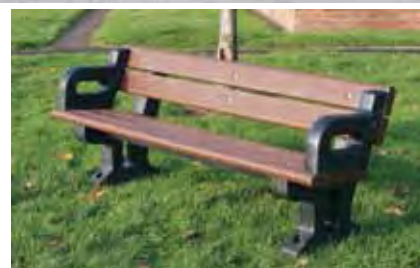
Phoenix Seat with Armrests also available

Length: 1790mm Seat Height: 428mm Depth: 574mm Overall Height: 702mm Total seat weight including: Enviropol slats: 75kg Enviropol slats: 90kg c/w 2 armrests Timberpol slats: 79kg Timberpol slats: 94kg c/w 2 armrests Supplied fully assembled for immediate use or in flat-pack form.