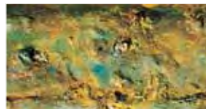
Without Armortec Coating

The Glasdon Armortec-coated post lasted 5 times longer than the other sample.