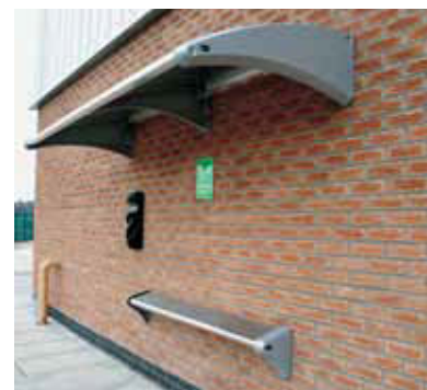
Carleton Perch Seat Model 1800 c/w Stainless Steel seat pan. Co-ordinating Carleton Canopy and Ashmount SG® Cigarette Bin.