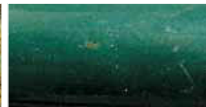
With Armortec Coating

Both mild steel post samples were subjected to repeated impact with a metal hammer. This was followed by six months in a salt spray cabinet in the Glasdon Quality Assurance Laboratory.