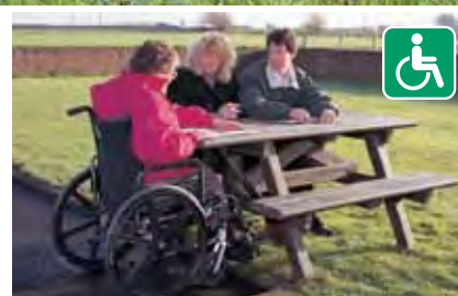
Wheelchair access model