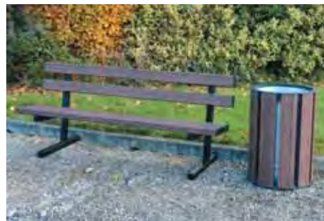
Fusion Seat with co-ordinating Fusion™ Litter Bin.