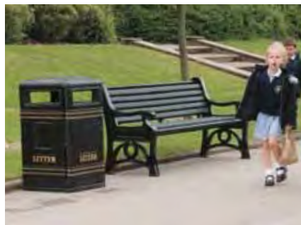
Stanford Seat with co-ordinating Brunel™ Litter Bin.