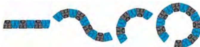
Linear 6 seats for 18 children