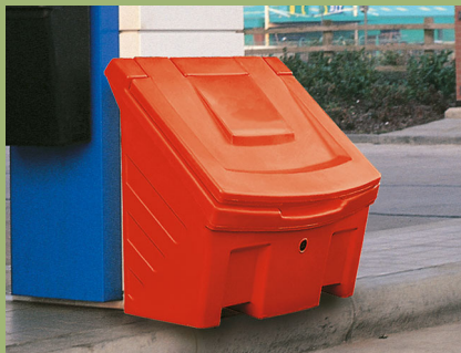
Slimline™ Storage Container

All Glasdon grit/salt containers can also be used for general-purpose storage, giving them all-year round versatility. Ideal for sand, tools, fertiliser, spill kits and other site equipment in addition to grit/salt storage.