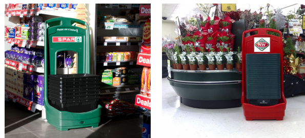
1. Mobile Basket Buddy™ Storage Unit

Ideal for supermarkets and convenience shops, Mobile Basket Buddy is an indoor storage unit for baskets, whilst encouraging customers to take a basket. The integral handle and wheels make it easy to manoeuvre.