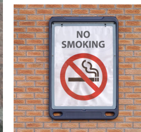
1. Advocate™ Poster Display Sign