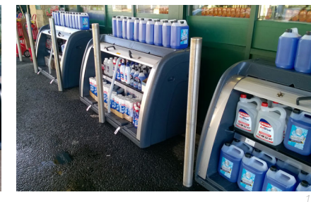
1. Orion™ Storage Unit