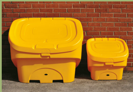
Nestor™ 400 & 90 Storage Container