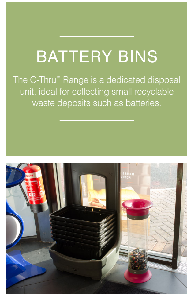
1. C-Thru™ 5, 10 & 15 Battery Recycling Bin