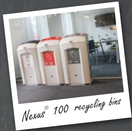
Nexus ® 100 recycling bins

Use colour co-ordinated aperture panels with identifiable graphics and user-friendly guides to indicate which waste streams are collected. This will help minimise cross-contamination whilst increasing recycling rates.